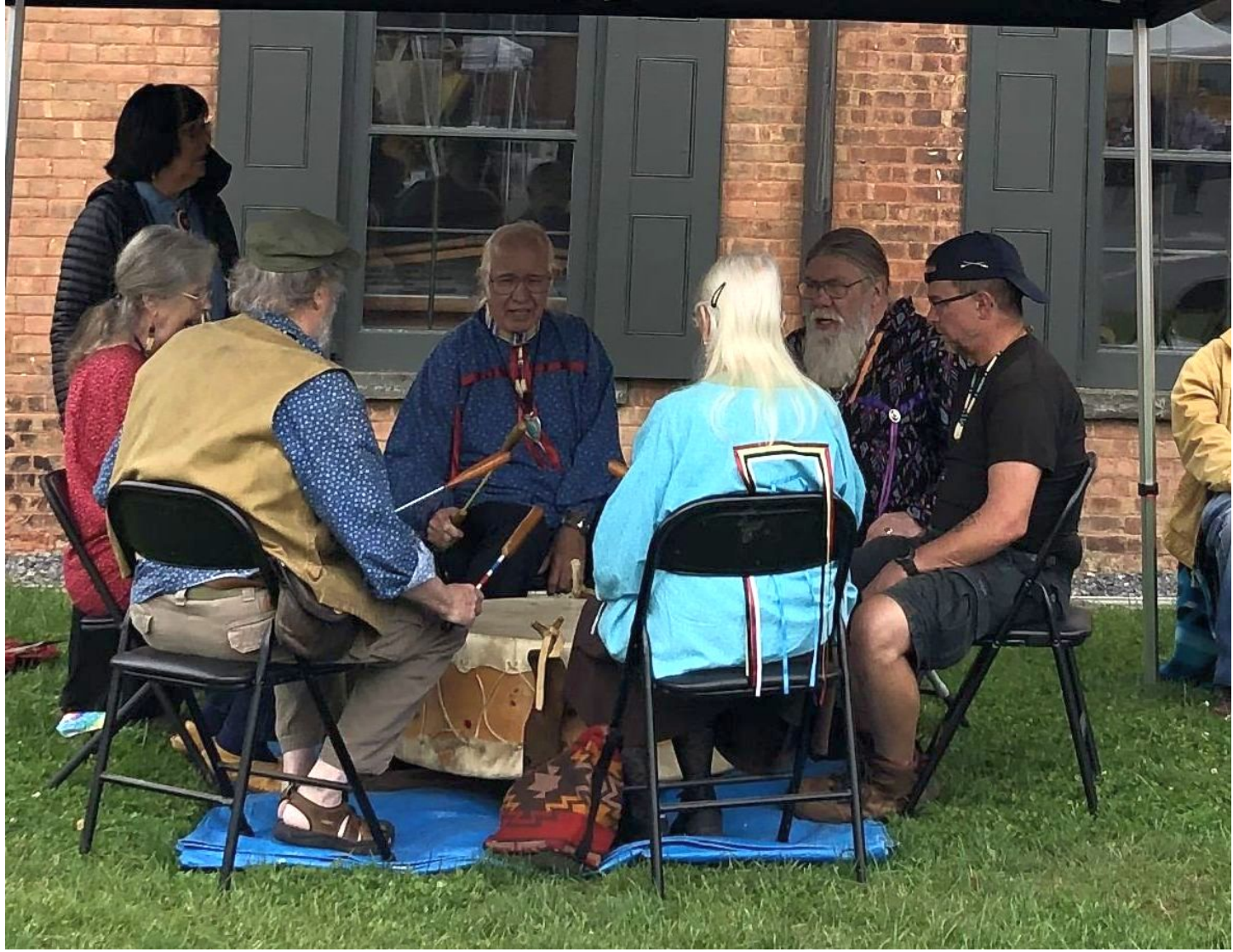
Visitors joined the Red Feather Singers and Drummers for a day of Native American drumming, crafts and artifacts.